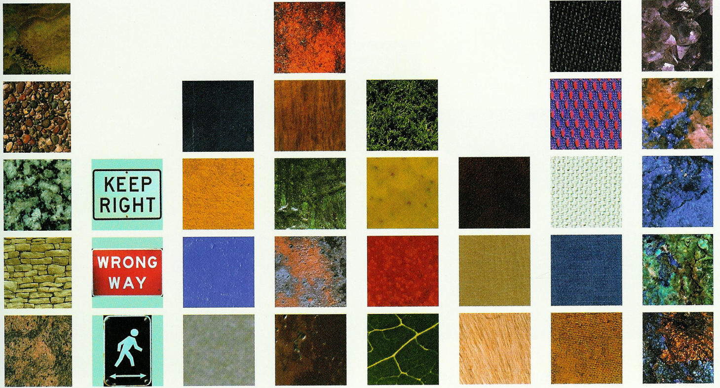
architecture signs paint metal organic animal skin fabric mineral